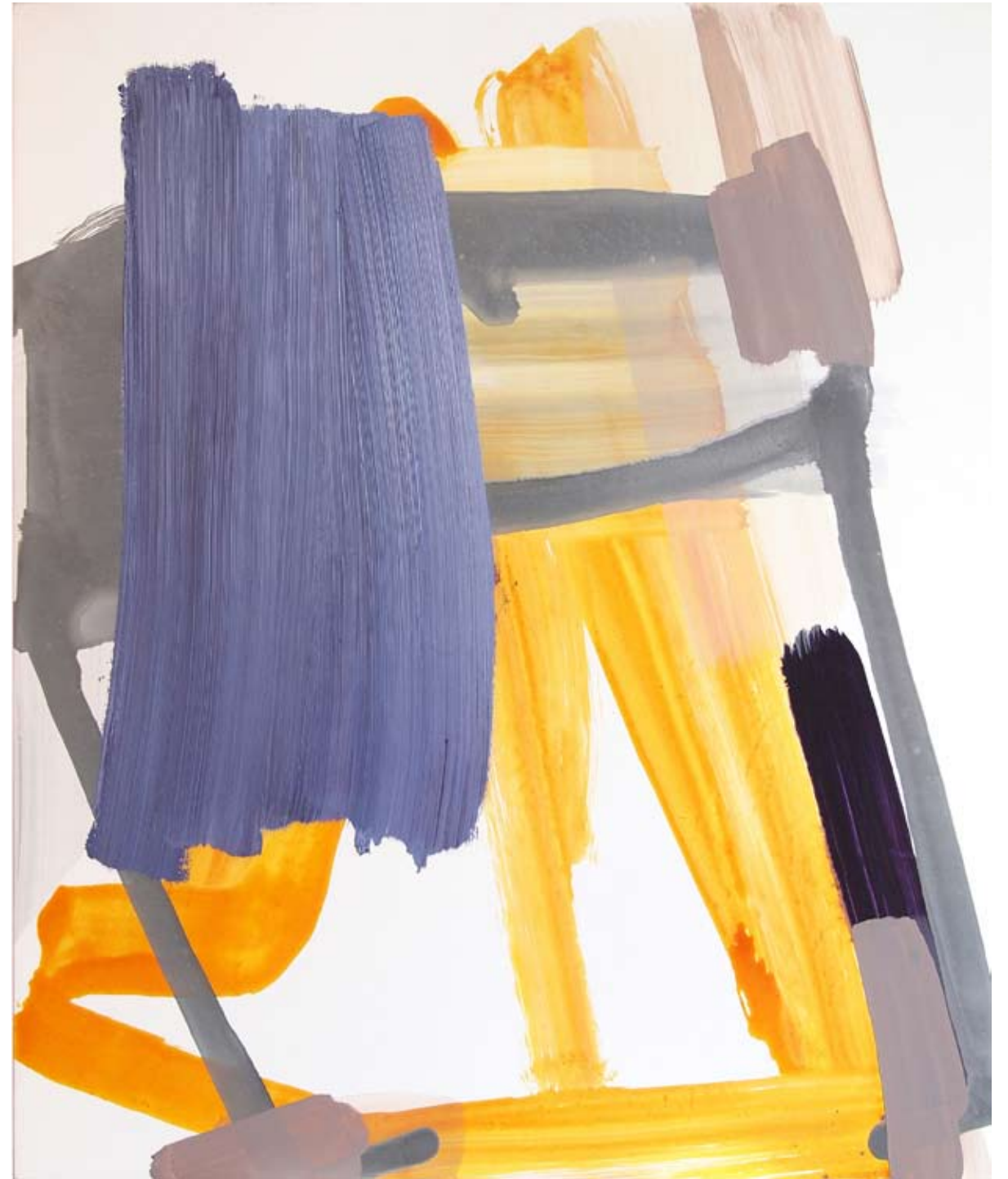
out the door , 2013 oil and flashe on canvas 36 x 30 in. (91.5 x 76 cm) cat. no. JOM04